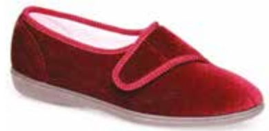
LILIAN SLIPPER AUD $35.00

Available Sizes: 5, 6, 7, 8, 9, 10, 11 Available Colours: Deep Navy, Wine