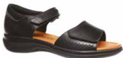
JACE SANDAL AUD $80.00