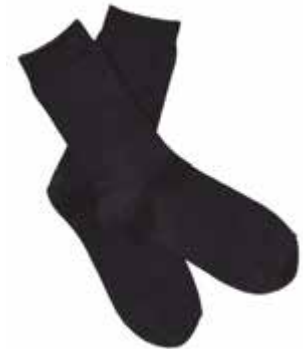
CIRCULATION SOCKS AUD $16.95

Available Sizes: To fit shoe 7-11 and 11-14