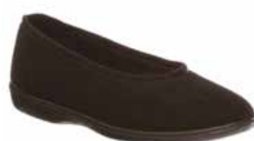
COOPER SLIPPER AUD $30.00