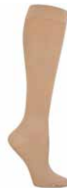
CIRCULATION SOCKS AUD $16.95

Available Sizes: To fit shoe 7-11 and 11-14 Available Colours: Beige, Black, Navy Blue