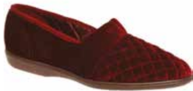
MARCY SLIPPER AUD $30.00

Available Sizes: 5, 6, 7, 8, 9, 10, 11 Available Colours: Black, Deep Navy, Wine