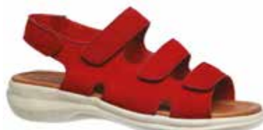
JEANIE SANDAL AUD $80.00