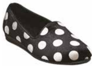
DORIS SLIPPER AUD $30.00

Available Sizes: 5, 6, 7, 8, 9, 10, 11 Available Colours: Black and White Spot