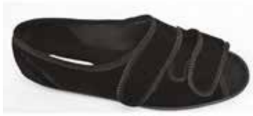
ALEXA SLIPPER AUD $30.00

Available Sizes: 6,9 (Limited Stock left) Available Colours: Black