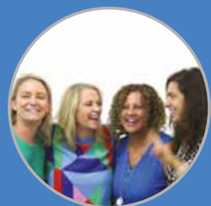
The Caring Team