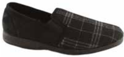
FABIO SLIPPER AUD $45.00