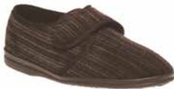
THURSTON SLIPPER AUD $45.00