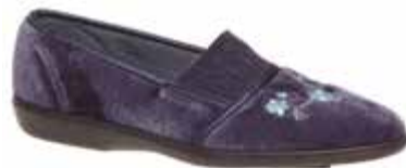
SASHA SLIPPER AUD $35.00

Available Sizes: 5, 6, 7, 8, 9, 10, 11 Available Colours: Heather, Mid Blue