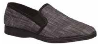
PATRICK SLIPPER AUD $45.00