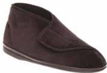
TARQUIN SLIPPER AUD $45.00