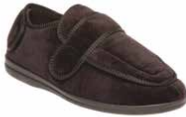
FRANCIS SLIPPER AUD $45.00